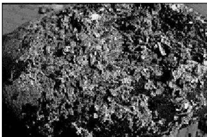
White rot fungi, the only organisms able to biodegrade wood, is so good at digesting just about everything that they will be used to biodegrade toxic chemicals.

"This ability of fungi to attack and degrade concrete and other materials has implications not only for the weathering and corrosion of buildings but is also relevant to nuclear decommissioning, for example," Professor Gadd said. Imagine what fungi can do to the brain if they can eat out the concrete esophagus put around nuclear sites like Chernobyl.