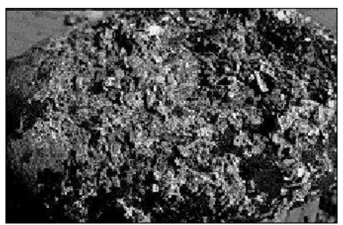
White rot fungi, the only organisms able to biodegrade wood, is so good at digesting just abut everything that they will be used to biodegrade toxic chemicals.

When fungi are fed the food they love they become more virulent. Their ability to penetrate and root into the intestinal walls, for example and invade the cells is increased. They not only attach themselves to human tissues but can actually invade the cells where they become quite at home. Thus they are not secondary but primary infections that have been helped along with runaway antibiotic usage, dental amalgam, flu vaccines laden with mercury, mineral deficiencies and by terrible modern diets infected with molds and yeasts as well as many potent poisons.