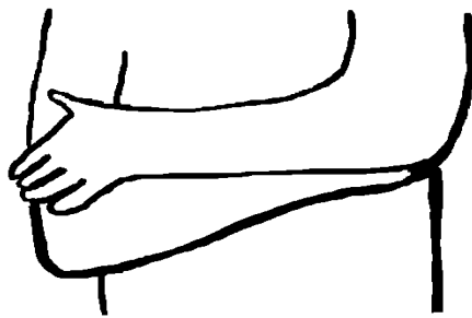
Left Hand Touching Above Right Elbow